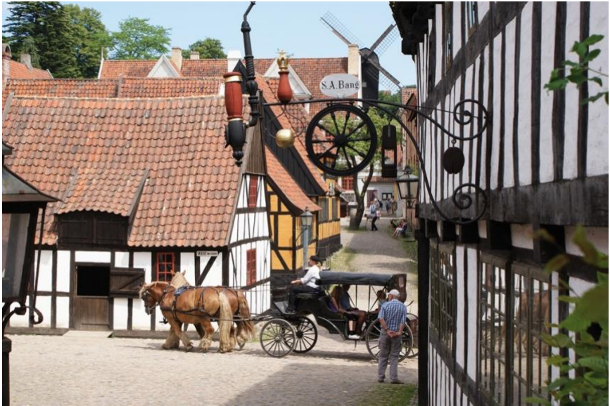
"The Old Town"